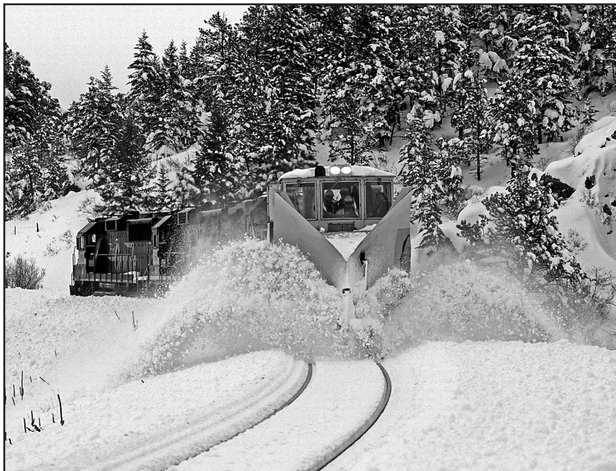
Snow fighting equipment near Clay on the Moffat line in 2003.